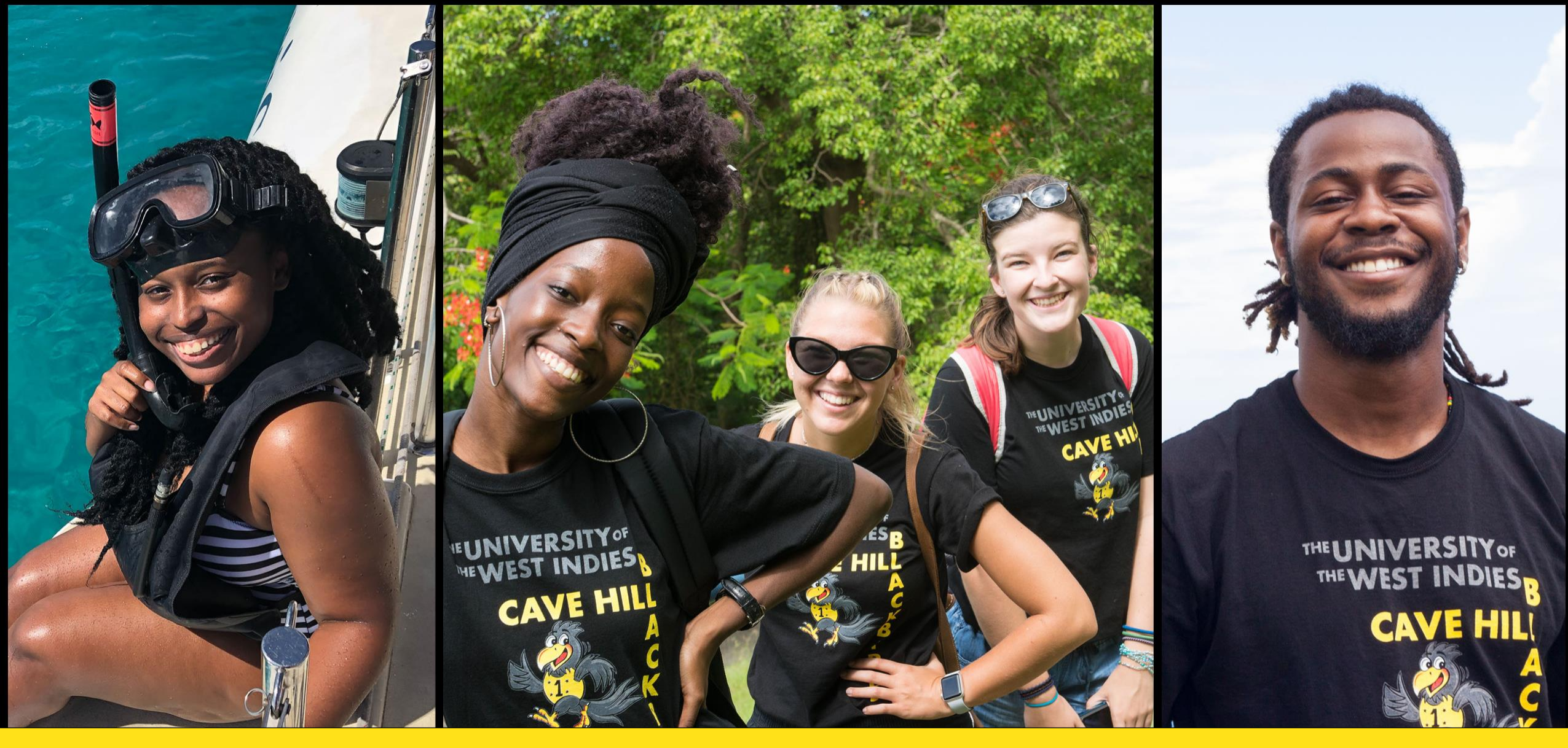
Enjoy your education abroad experience in beautiful Barbados. Use this opportunity to experience a new culture as you enjoy the vibrancy and beauty of Caribbean life and living.